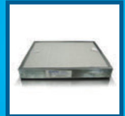
F074 Medical Grade HEPA