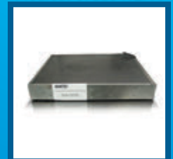
F072-GPC Chemical Filter