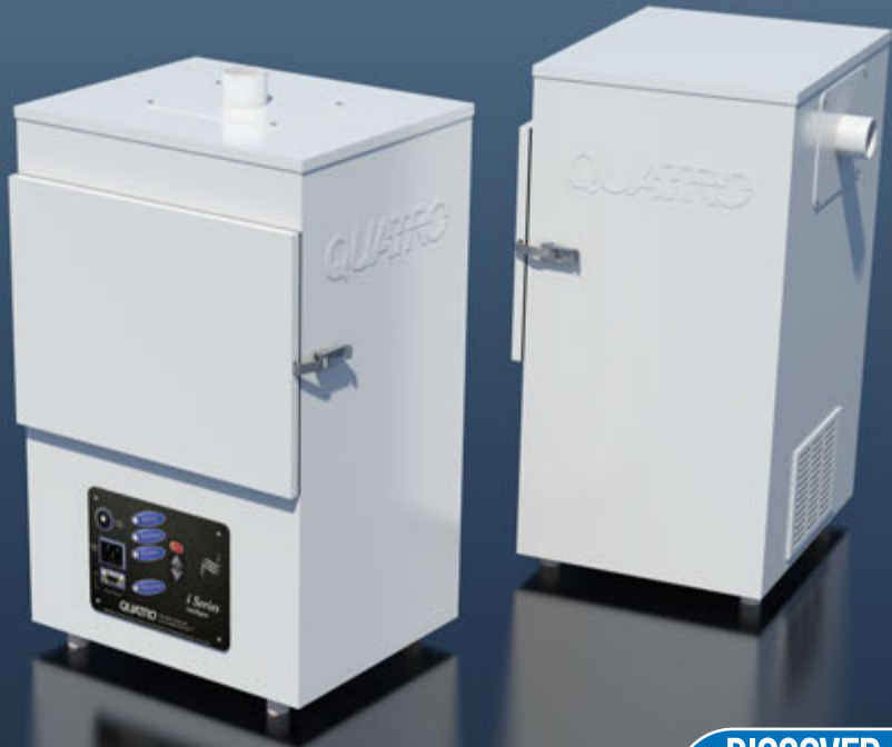
Available with top inlet plate (left) or side inlet plate (right)