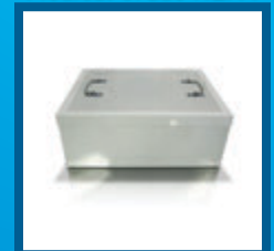
AG097 Chemical Filter