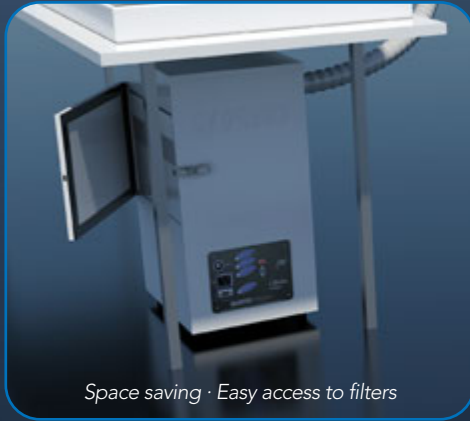
Space saving · Easy access to filters