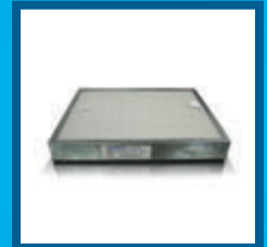
F074 Medical Grade HEPA